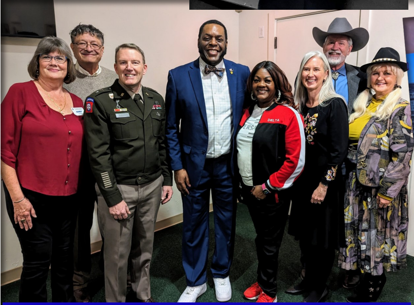
Military—City—MOAA Working Together