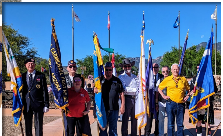
Doing MOAA Business on Fort Huachuca