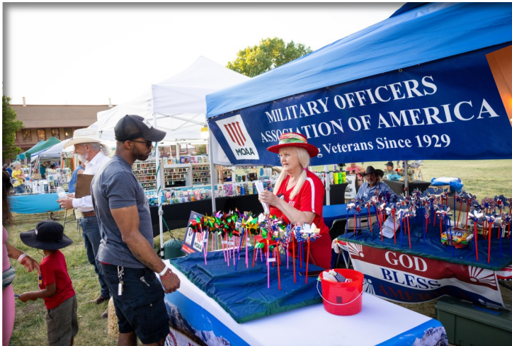
Doing MOAA Business on Fort Huachuca