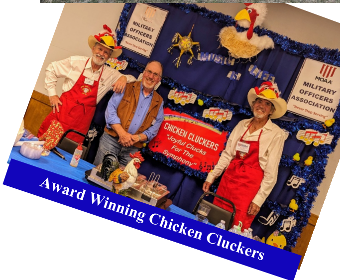
Award Winning Chicken Cluckers