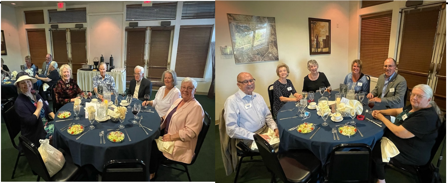
Long time and “new” members pose for photo at April Dinner meeting.

JOIN US for a good and interesting time.