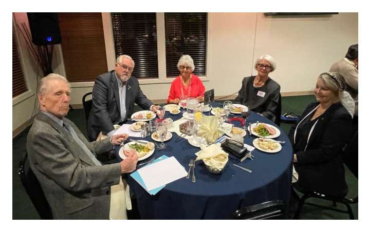
Who attends the Chapter Member Meeting dinners?

Local Community Leaders, Spouses, Church Leaders, Realtors, Rotarians, Educators, Flag Officers, Lieutenants, etc. We need you to complete our complement.