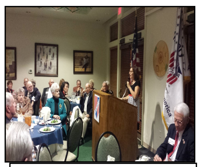
Representative McSally delivering her spirited address to an appreciative and attentive audience

When making a dinner reservation for the monthly MOAA dinner, please submit your reservation request as early as possible. We are limited on the number of members we can accommodate due to meeting room limitations. In the future, when we exceed our capacity to accommodate everyone, we will accept reservations in the order they are received, based on the postmark date. Reservations with the latest postmark will be returned when exceeding our capacity. The Heliogram reservation request form will indicate the date the request must be postmarked by.